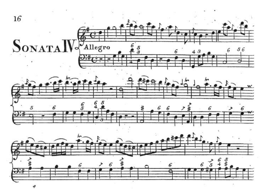
Figure 6. Opening of the first movement of Eiffert's Flute Sonata IV.

included portraits of acquaintances as well as more fashionable genres such as landscapes and historical and religious subjects.<sup>17</sup> We don't know whether Eiffert invested in art like Simpson and Handel, but from what we know about him, he seems to have been sufficiently well regarded for a wealthy patron to commission a portrait of him, or to have had adequate funds to pay for one himself.